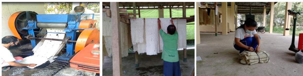
Fig. 4. Milling (a), drying (b) and baling rubber crepe (c), KaMaSi Association, Kidapawan City, North Cotabato, Philippines, 2020