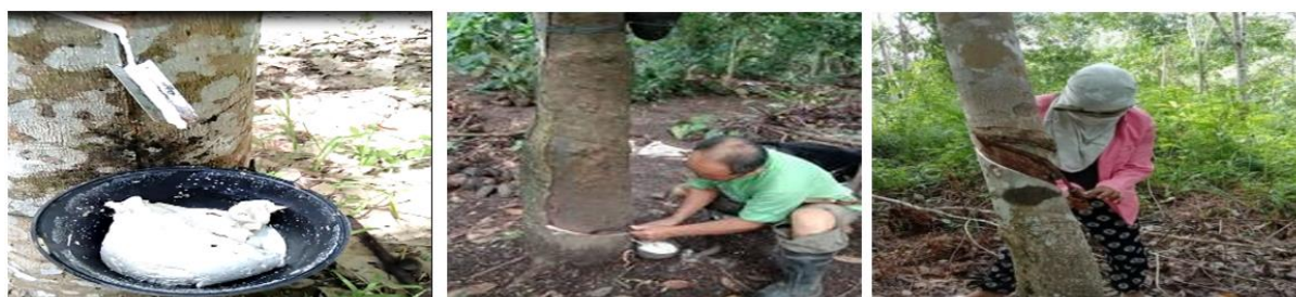
Fig. 2. Rubber tapping, KaMaSi Association, Kidapawan City, North Cotabato,

Tapping is usually done at dawn or early in the morning. Density and consistency of latex varies according to climatic conditions and time of tapping. Early morning tapping is said to have an increased productivity and a premium quality latex harvest with substantial reduction in the percentage of coagulum. Collected latex was stored in a plastic drum and transported to the processing site by means of a tricycle. Initially, farmers added sodium to the liquid latex to avoid improper coagulation.