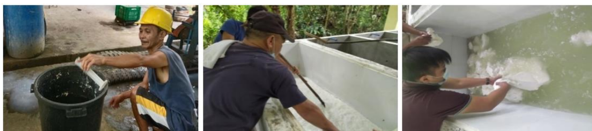
Fig. 3. Adding formic acid, soaking and mixing, collecting coagulated block of latex, KaMaSi Association, Kidapawan City, North Cotabato, Philippines, 2020

After removing the coagulated latex for milling, the formic acid/water solution in the tub was discharged to the ground.