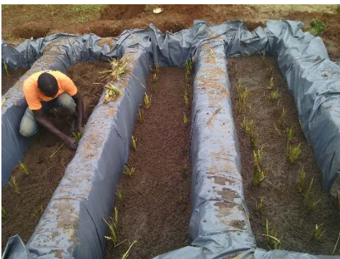
Fig. 2. Planting Vetiver Grass (3/1/2016)

The Vetiver grass slips of 300mm height were obtained from Kenya Agricultural and Livestock Research Organization (KALRO) in Kisii and planted at a spacing 100 mm within and 150 mm between rows in the substrate of the Horizontal, Vertical and Hybrid subsurface flow wetland systems. Diammonium Phosphate (DAP) fertilizer was used at planting to enable root establishment since the substrate had low N and P content of 1200 and 19 mg/kg, respectively. For a period of one month since planting, they were watered with fresh water and subsequently in the 2 nd and 3 rd month with wastewater from the maturation pond. The Vetiver grass in all the wetland units began to continuously receive wastewater based on the experimental flow rate of 0.036\text{m}^3\text{d}^{-1} at the beginning of the fourth month for a period of 8 weeks into the Horizontal subsurface flow system. In the Vertical subsurface systems, it was intermittently fed with two batches daily with each batch having 0.018\text{ m}^3 . Figure 2 and 3 shows the Vetiver grass at planting and at three months period since planting, respectively.