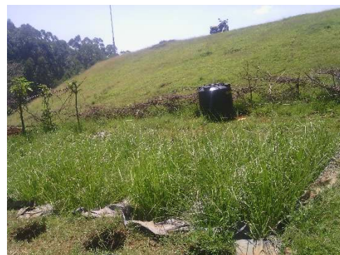
Fig. 3. Vetiver Grass at three months since planting (2/4/2016)