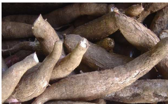
Fig. 4: Cassava samples used

The cassava tubers (Fig. 4) were harvested from the crude oil polluted environment in triplicate and the control gotten from the unpolluted farmland and were labelled and taken to the laboratory for proximate analysis.