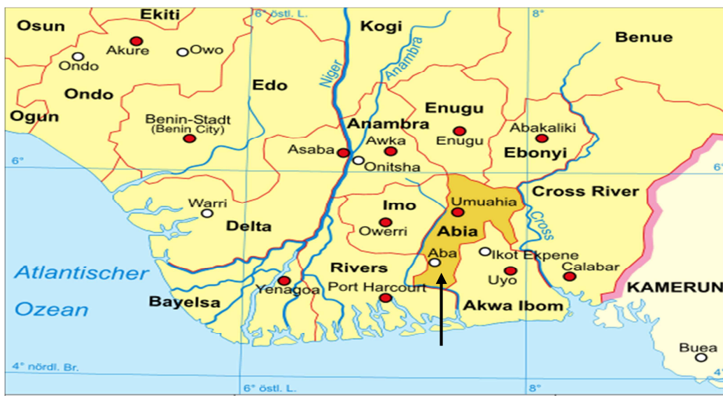
Fig. 1: A cross-section of the Map of Nigeria Showing Abia State, Nigeria [5]

The study site is around the vicinity of Imo River-2 flow station at Owaza in Abia State of Nigeria (Fig. 1 and 2), located East of Nkali and North of Isimiri flow stations in the Niger Delta Basin where oil spill do occur, which is most times caused by valve failure like the one that occurred in September 20, 2003 at the relief pit behind the flow station (Fig 3) and covered over five hectares of arable land. It was estimated at that time that about 30,000 barrels which is approximately 4.8 million litres of crude oil were released.