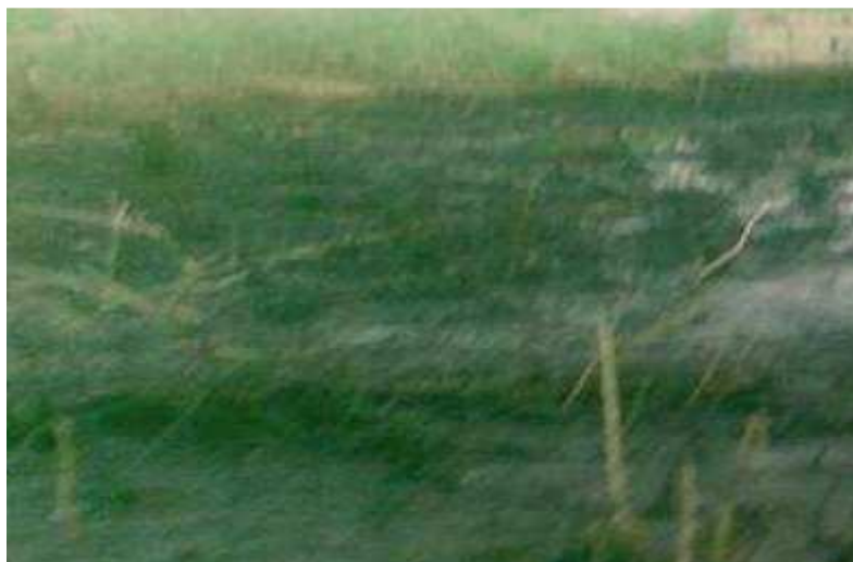
Fig. 3: An oil polluted land within the environment of Shell Petroleum Development company oil flow station at Owaza in Ukwa West Local Government Area of Abia State, Nigeria