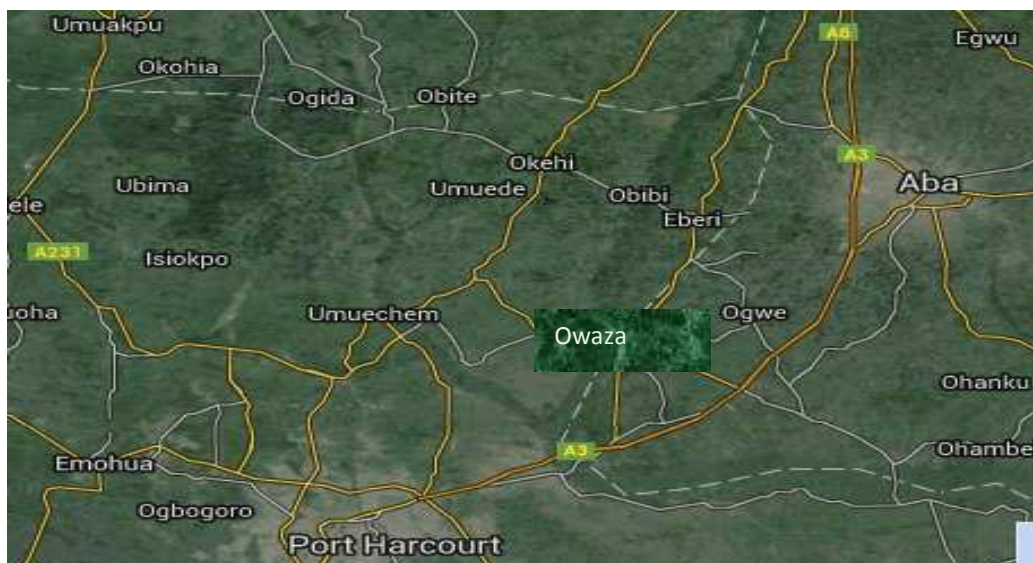
Fig. 2: A Map Showing Owaza and its Environs [6]