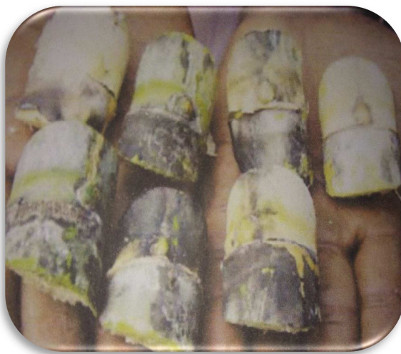
Figure. 2. bud cutting method