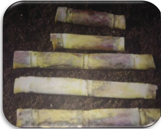
Figure. 1. traditional method

The need for sugar cane bud chipper is only for the farmers, where they are using an full size of sugarcanes in the field for the plantation purpose, while using this sugar cane bud chipper we can cut it down in to small pieces, compact in size it can also used for plantation from this we save the wastage of remaining portion of the sugar cane.