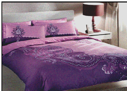
Fig. 3. Feng Shui bedroom design

Classic Chinese Feng Shui bedroom decorating ideas help arrange light bedroom designs and comfortable décor for people to enjoy inner peace and pleasure in beautiful bedrooms. ( http://www.design-decor-staging.com/blog/feng-shui-home-design-feng-shui-bedroom/32928 , 2015) Upholsteries play a very important role in creating the perfect soothing atmosphere. Calming colors such as Pastel and sober colors need to be chosen for peaceful sleep. Shades of greens, pinks, blues and violets are soothing to the eyes and the mind. But pink is the most suitable for bedroom as it is ideal for relationship. (Helm, 2009, 10) Avoid excessively bold and flashy colors like bright red, dark green, brown, etc. As they bring a heavy feeling within. The design and patterns must also be relaxing. ( http://etips.sulekha.com/feng-shui-tips-for-harmonious-bedroom_3118 , 2015)