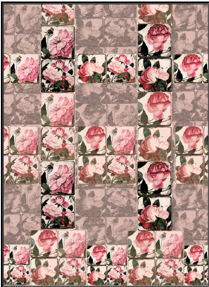
Design Idea no. (3).