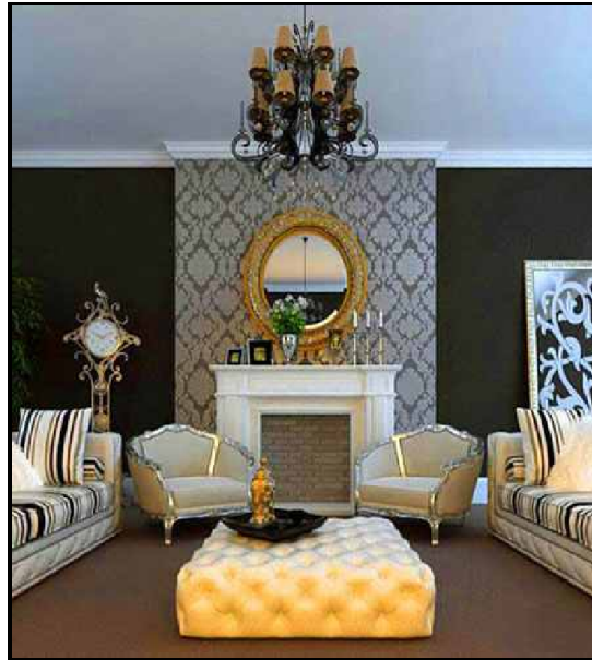
Fig. 2. Feng Shui living room design