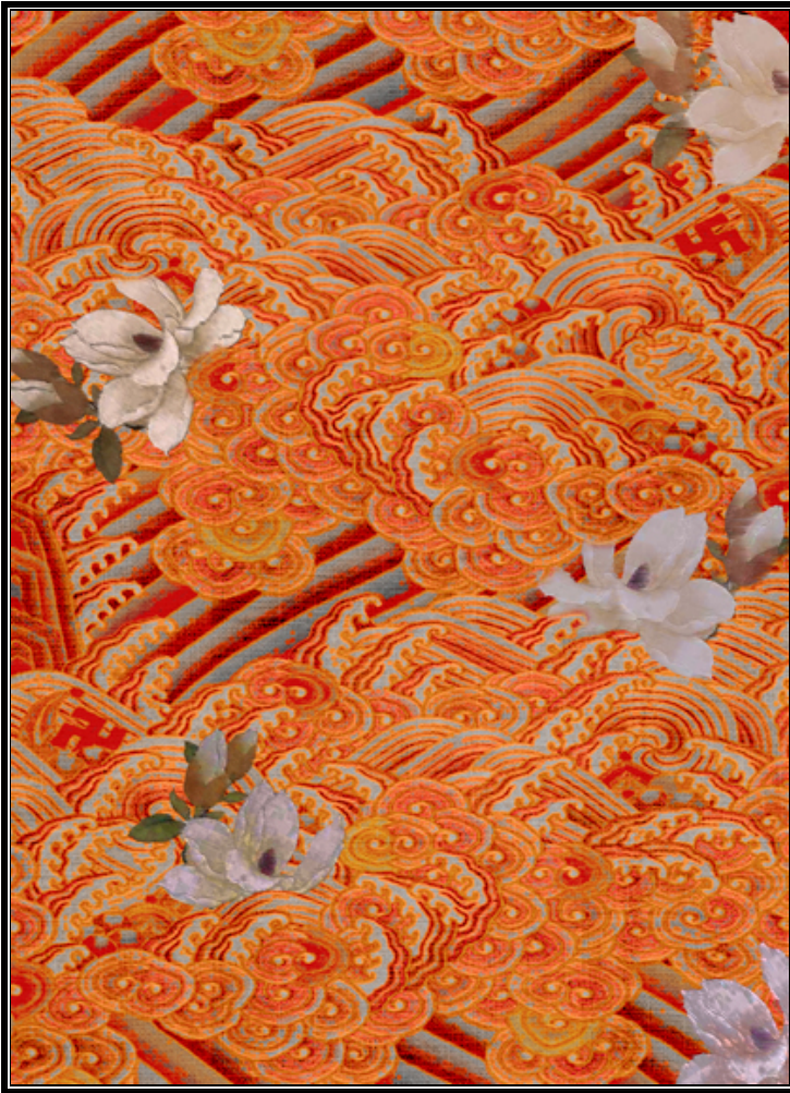
Design Idea no. (6).