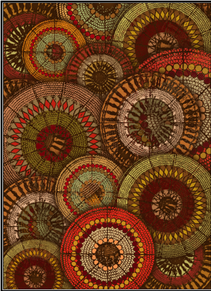
Design Idea no. (2).

*Color: This idea depends on the using a combination of earth colors ( brown – green) and fire colors ( red – orange – yellow). (www.sereneinteriors.com, 2015) These colors combination supposed to have a great positive impact on spaces that are open to activities and conversations, bring stability and balance to living rooms.