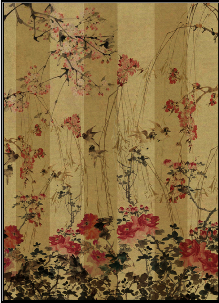
Design Idea no. (4).