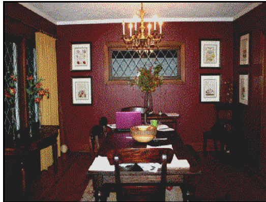
Fig. 4. Feng Shui dining room design

2009, 13) Light blues and greens are also positive to promote pure feelings of joy, romance and tranquility to the dining room. ( http://etips.sulekha.com/feng-shui-blending-colors_2480 , 2015)