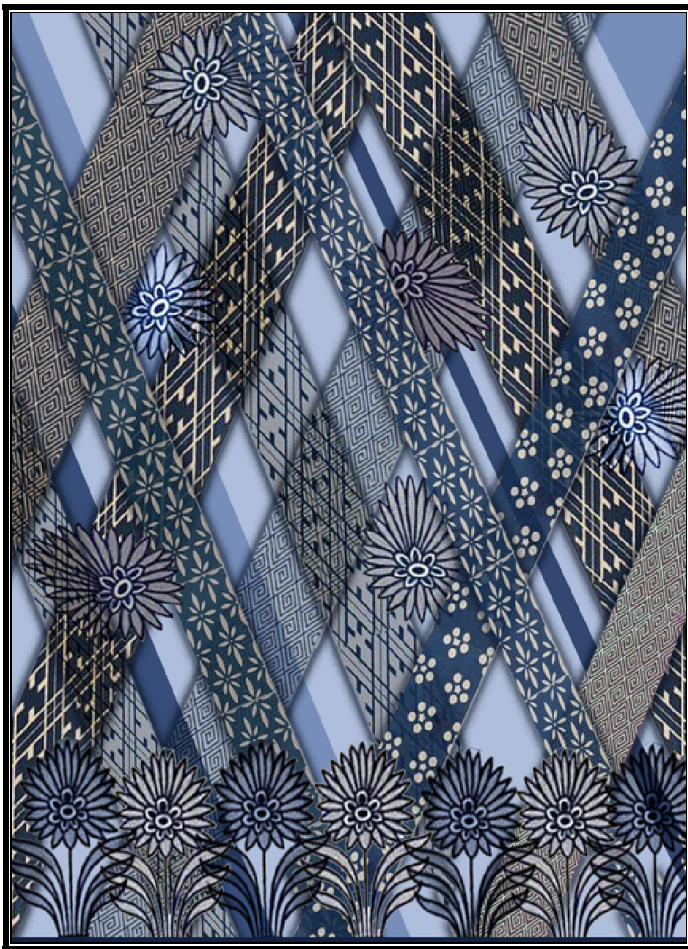
Design Idea no. (1).