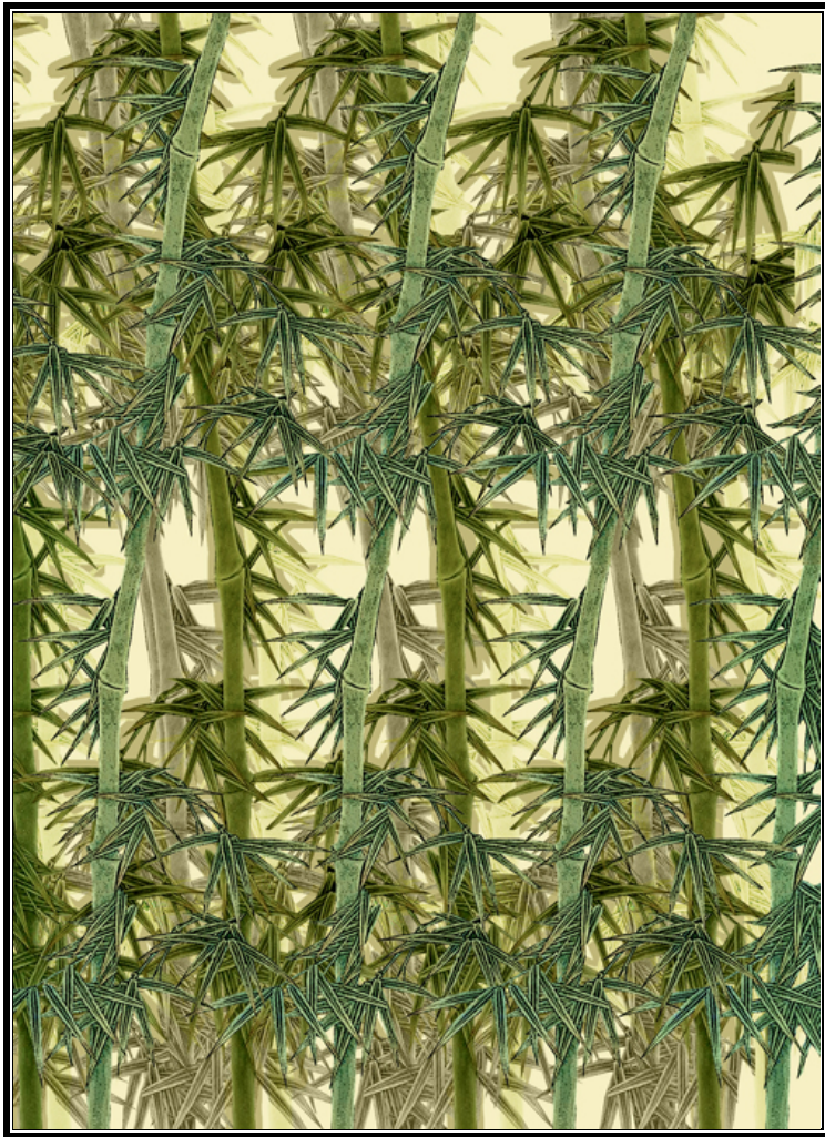
Design Idea no. (5).