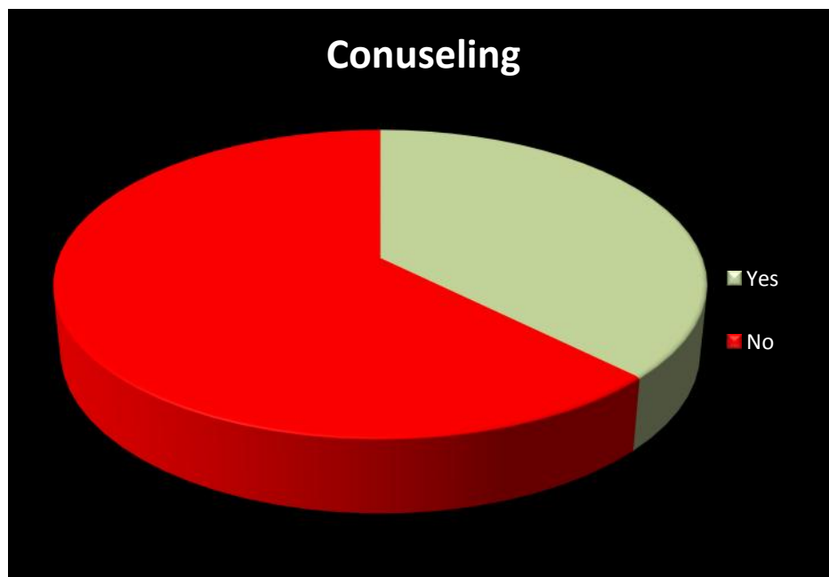
Fig. 2. Counseling on Target Weight Gain and Balanced Diet